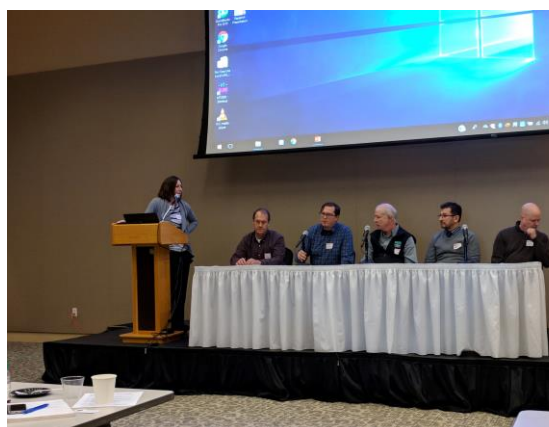
2018 NFFA-WMC Workshop in Silver Spring, MD

On Tuesday, April 10, 2018, the NFFA and the WMC hosted the first of the three planned workshops at the Tommy Douglas Conference Center in Silver Spring, Maryland entitled, “Exploring Opportunities for Integrated Mapping and Functional Assessment of Riverine and Coastal Floodplains and Wetlands.” The overall goal of the initial workshop was to discuss current and potential opportunities to integrate geospatial mapping and functional assessments of coastal and riparian wetlands and floodplains, in order to improve land use decisions and resource management and to reduce risk from the impacts of flooding, sea level rise and other extreme weather events.