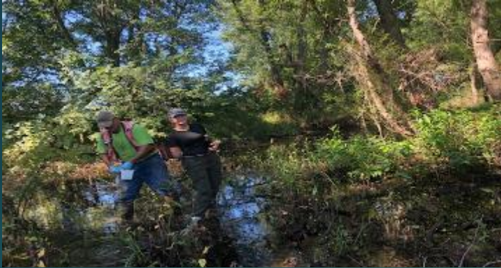
Wetland Program Coordinator